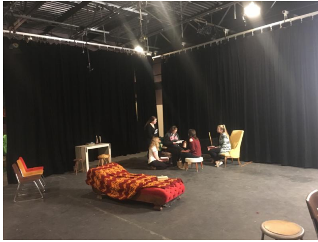
Black Box Stage Setting for upcoming production of Little Women .