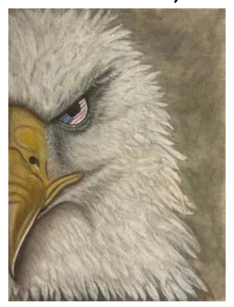
Cat Stowers, Wahkon

The Eye Of The Beholder Chalk Pastels and Ink on Paper $350