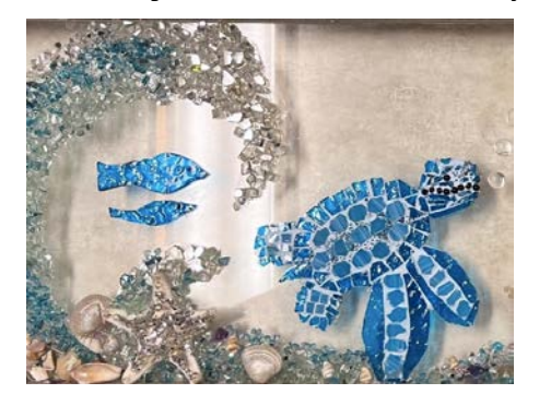
Kathryn Flom, Pine City

Whimsical Blue Ocean Creatures Mosaic $149