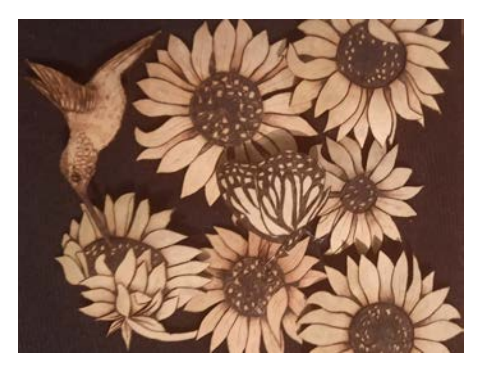
Dell Gross , Pine City