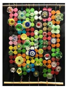
Cacophony of Color Tapestry Mixed Media ~ Plastics