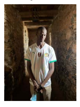
The Future Rewrites the Past - taken at the House of Slaves, Dakar, Senegal Photography $150