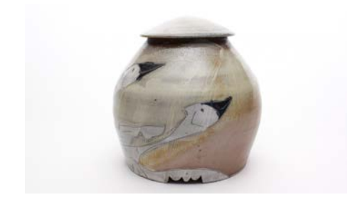
Sandhill Crane Jar Salt-fired Stoneware, Slips, Stains, Glaze $200 Display Only