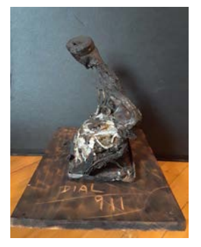
Ed Frost, Cambridge