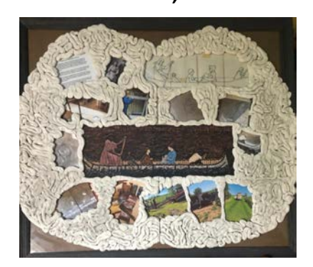
Susan Foss, Sandstone

Making a 15' x 5' mural Mixed Media $100