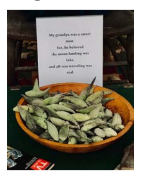
Roger Nieboer, Mora

World View #88 Assemblage $500 Display Only