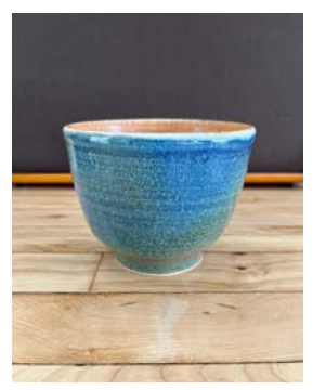
Nic Sabatke, Pine City