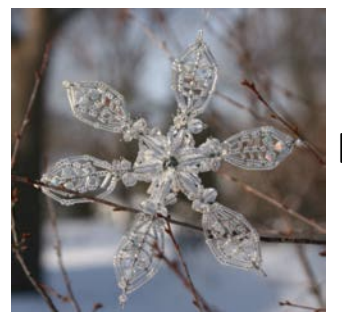
Snow Crystal Tree Beadwork; Glass Beads, Wire, Natural Branches NFS