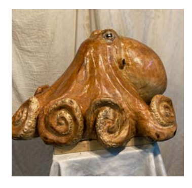
Octopus wood carving Chainsaw Wood Sculpture Carved from Aspen $1000