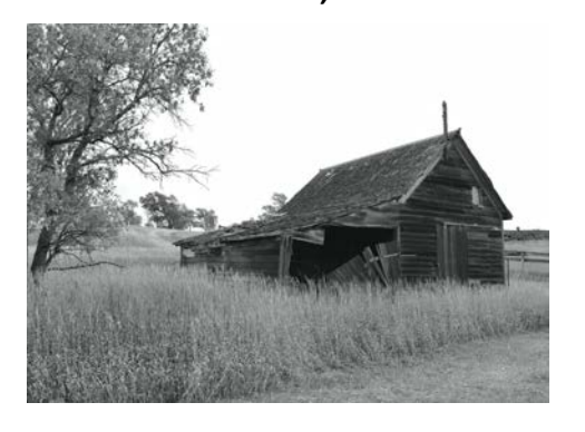
Barbara Orstad, Mora

Something Old, Something New Photography $125