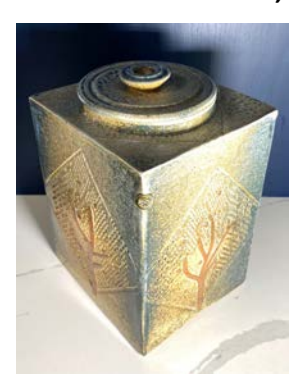
Sue Redfield, Cambridge