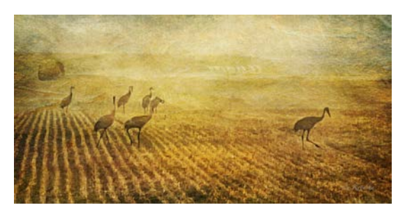
Cranes at Dawn Digitally Manipulated Photography $300