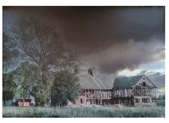
Victoria Frieberg, Stanchfield

Making a 15' x 5' mural Mixed Media $100