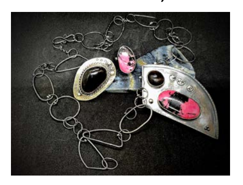
Threes are Special Sterling Silver, Black Onyx & Rhodonite NFS

Something Old, Something New Photography $125