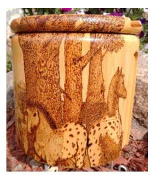
Cynthia Rue, Milaca

Watchful Eyes Drawing & Wood Burning $550