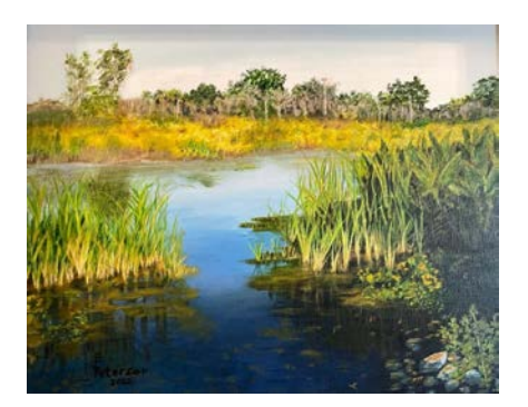
Picturesque Circle B Bar Reserve Acrylic NFS